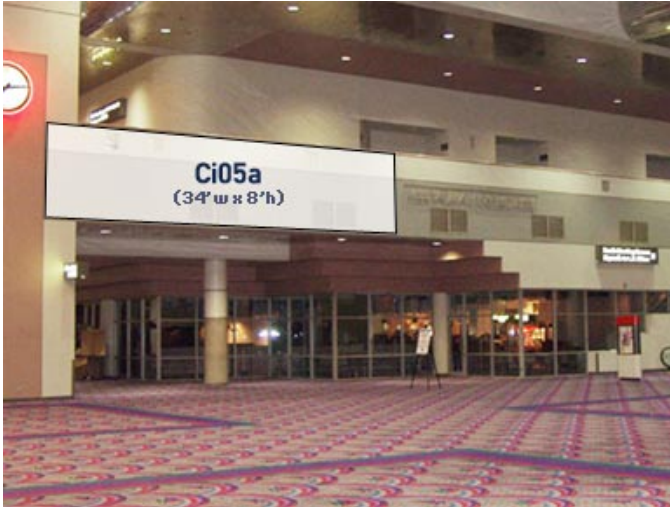
Ci05a (34' wide x 8' high)