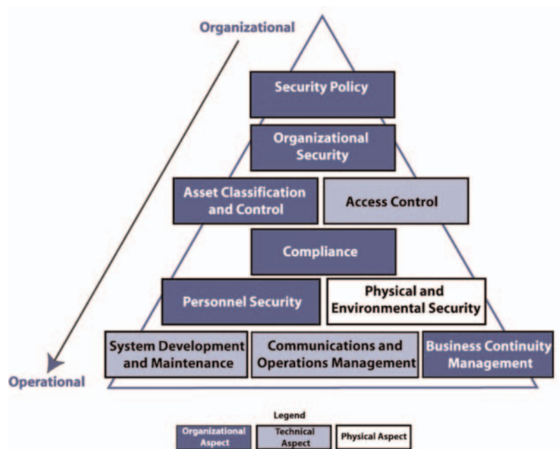
Figure 1: The Ten Domains of ISO/IEC 17799

In drafting a security policy and implementing appropriate security controls, organizations comply with legal require-